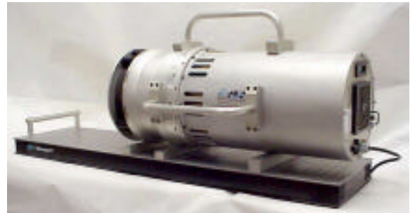
SQM-5002 system shown with table option.